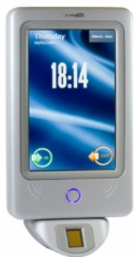
SuperTRAX Time Terminal

The employee can also “post” job and location times for past and future dates too, e.g., for meetings; this is as well as for recurring jobs/locations.