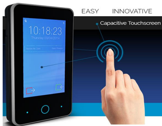
Super Glass 7

Locations include London, Glasgow Liverpool and Belfast.